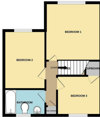
1ST FLOOR 423 sq.ft. (39.3 sq.m.) approx.